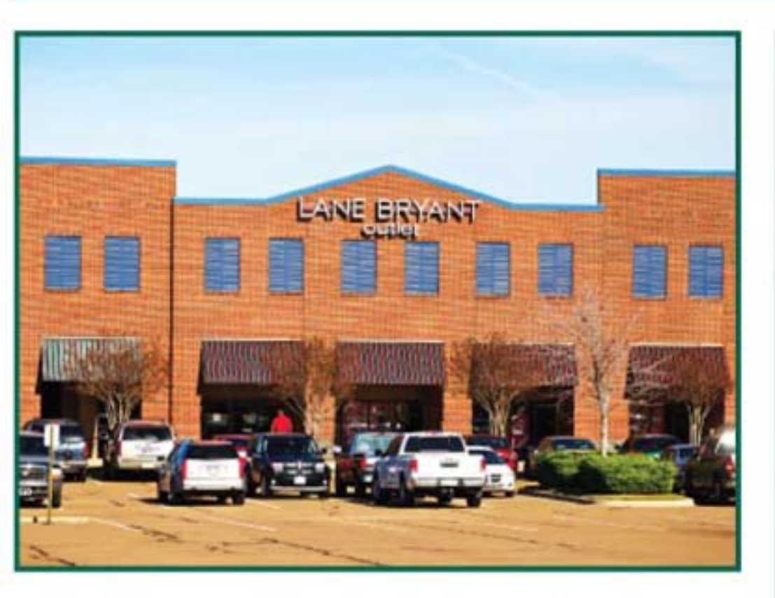
Retail Center in Prime Tunica Resorts Location