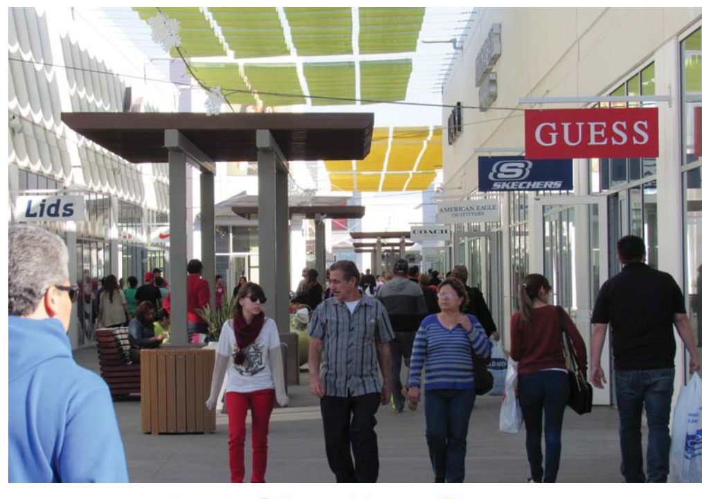
• • • Charles Company